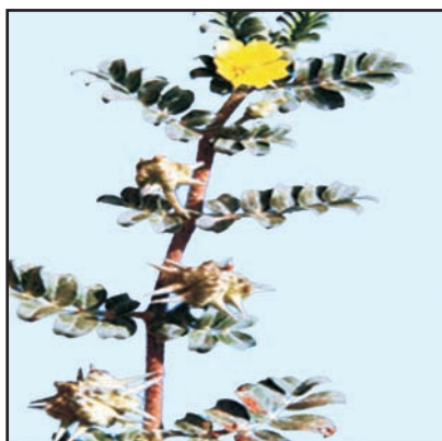
Gokshura twig with a flower and fruits.