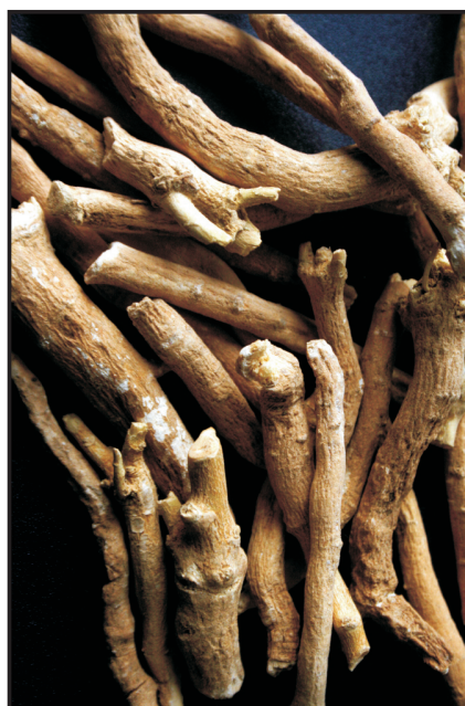
Dry Ashvagandha roots.