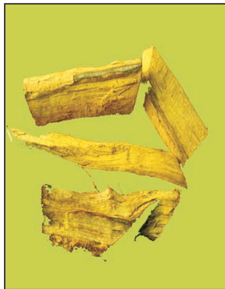
Roots of Daruharidra .