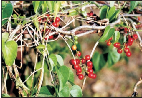
Guduchi stem with leaves and fruits.