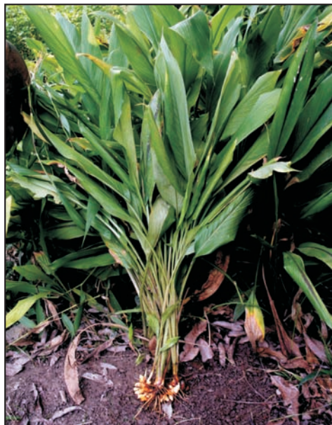
Whole plants of Haridra with rhizomes.