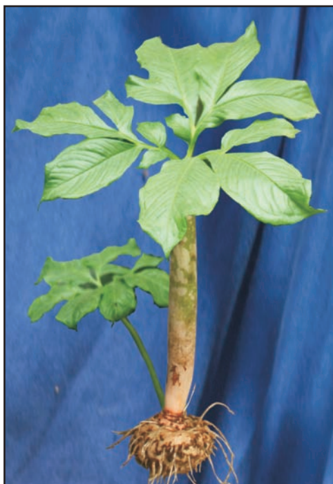
Full Surana plant.