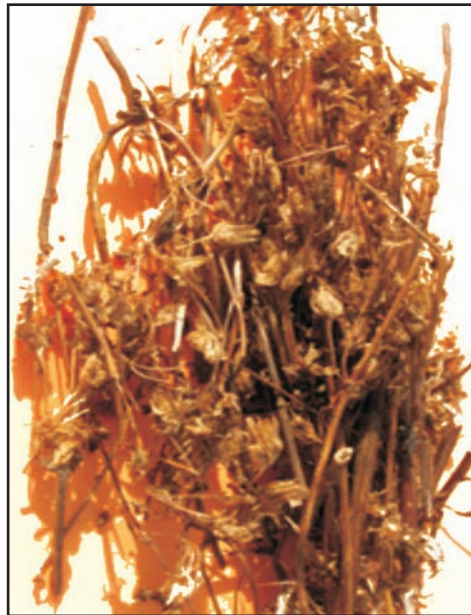
Dried Swertia chirata plants.