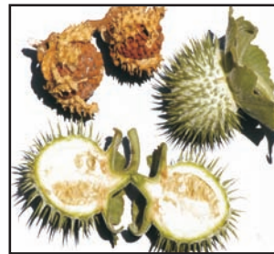
Cut-opened fruit of Dhatura .