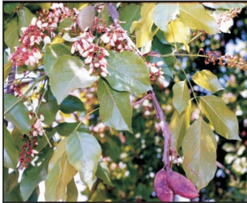
A flowering Pongamia pinnata branch with pods.