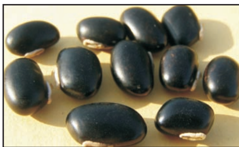
Dried seeds of Kapikacchu .