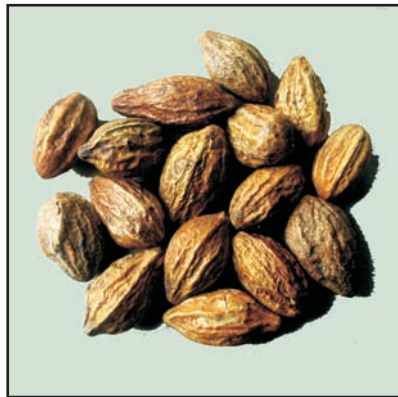
Dried fruits of Haritaki .