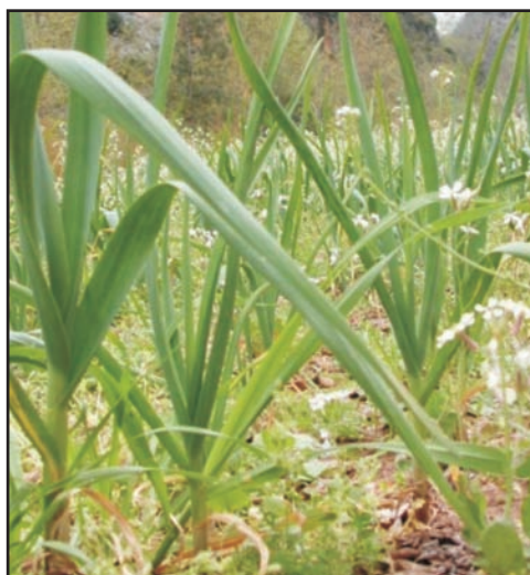
Cultivated plants of garlic.