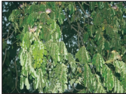
Leafy branches of a Shirisha tree.