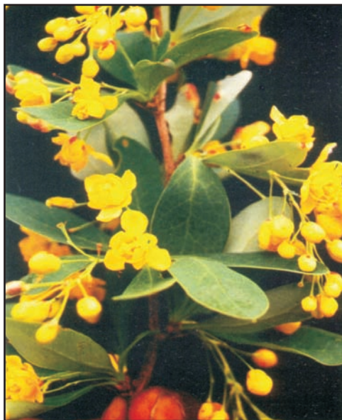
Flowering shoot of Daruharidra .