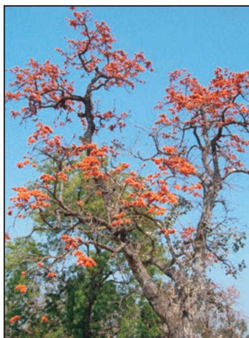
Palasha tree in bloom.