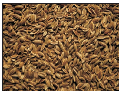
Dried, ripe Shatpushpa fruits.