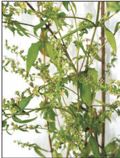
A Swertia chirata plant.