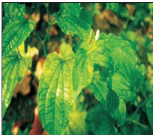
A flowering Pongamia pinnata branch with pods.