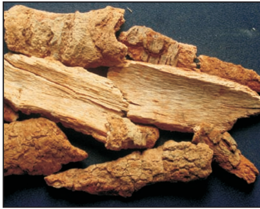
Dried stem bark of Lodhra .