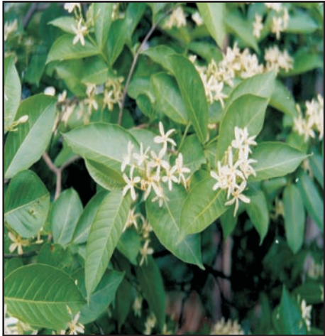
Leafy shoots with flowers of Kutaja .