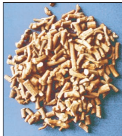
Dried Pongamia pinnata fruits and seeds.