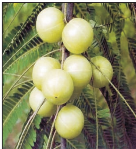
A leafy branch of Amalaki with fruits.