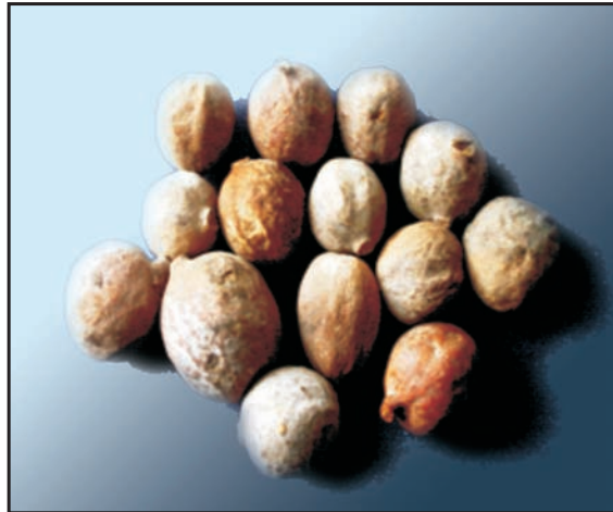
Dried fruits of Bibhitaki .