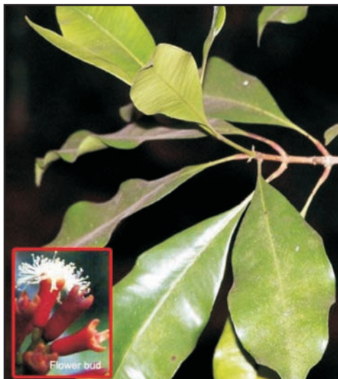
Leafy branch of Lavanga and unripe cloves in inset.