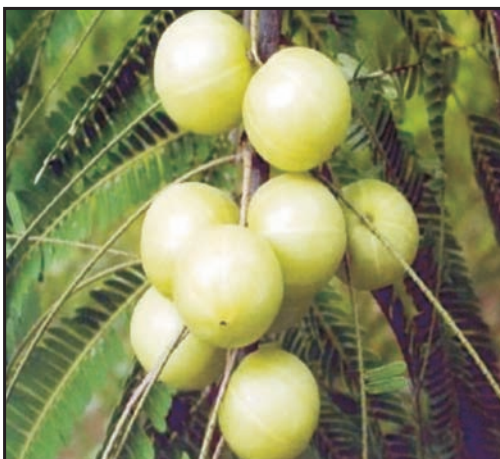
Amalaki fruits and leaves.