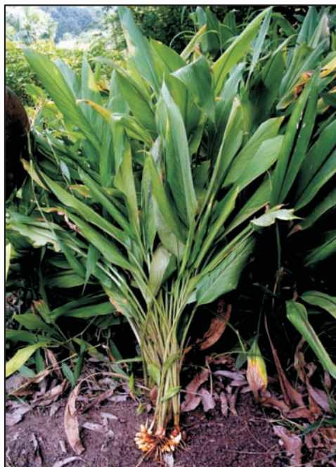
A bunch of turmeric plants.