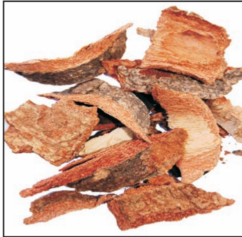
Dried stem bark of Kutaja .