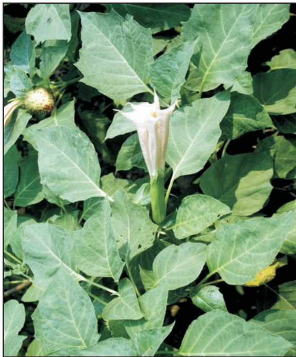
Leafy shoot of Dhatura with flower and thorny fruit.