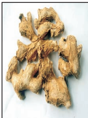
Dried rhizomes of Shunthi .