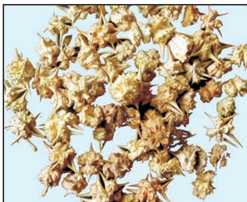
Dried Gokshura fruits.