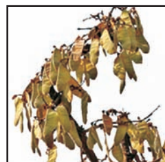
Pods of Palasha .