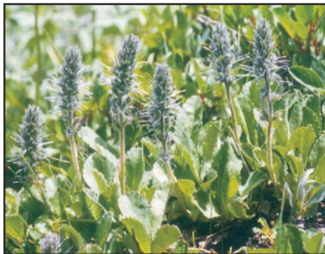
Katuka plants with flowering shoots.