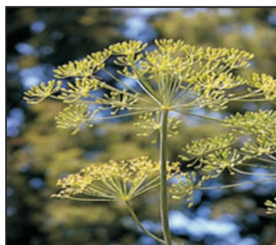
Unripe Shatpushpa fruits.