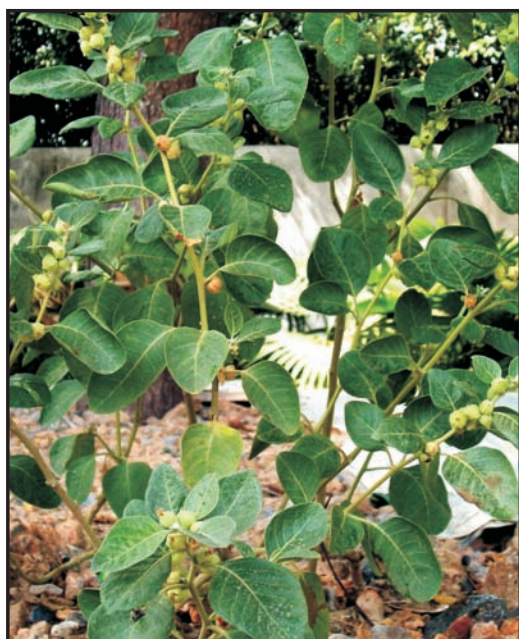
Ashvagandha plant with unripe and ripe fruits.