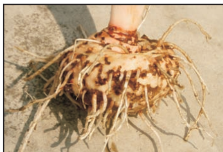
Unripe corm with roots.