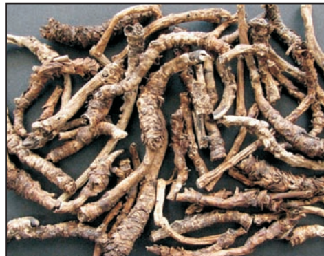
Dried Katuka roots.