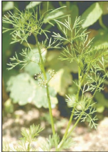
Terminal twigs of Ajamoda plant.