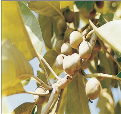
Bibhitaki fruits and leaves.