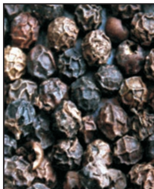
Dried fruits of Maricha .