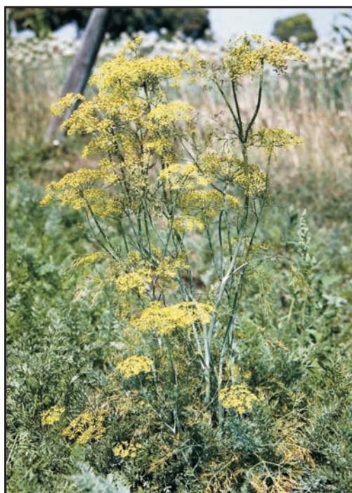
Flowering Shatpushpa plant.