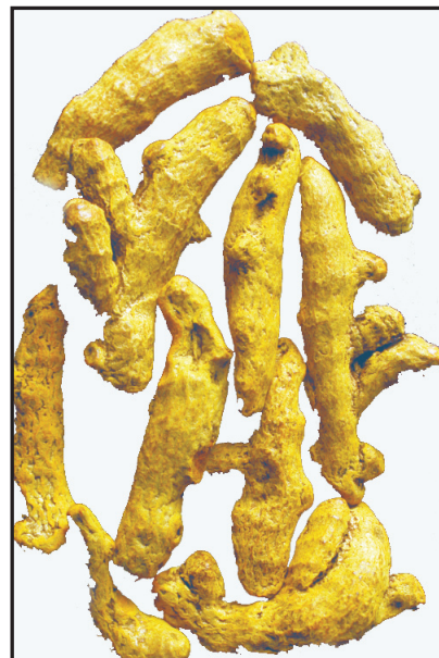
Dried rhizomes of Haridra .