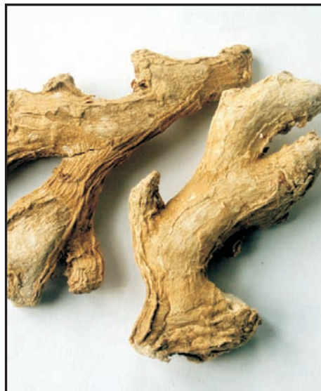
Dried Shunthi rhizomes.