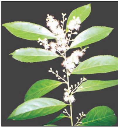
Leafy shoot with flowers of Lodhra tree.