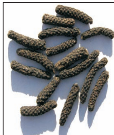
Dried fruits of Pippali .