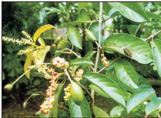
A fruit-bearing branch of Haritaki tree.