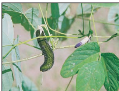
Pod of Kapikacchu .