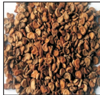
Dry seeds of Dhatura .