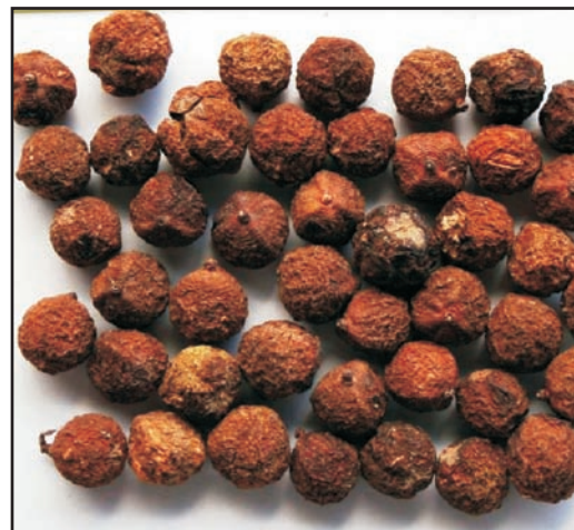
Dried fruits of Amalaki .

Main chemical constituents 2 : Vitamin C, minerals and amino-acids.