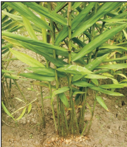
Shunthi plant with exposed rhizomes.