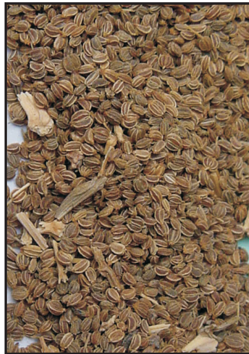
Dried Ajamoda seeds.