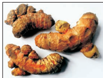
Fresh turmeric rhizomes.