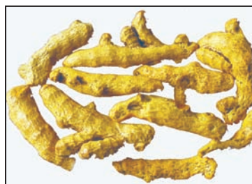
Dried turmeric rhizomes.