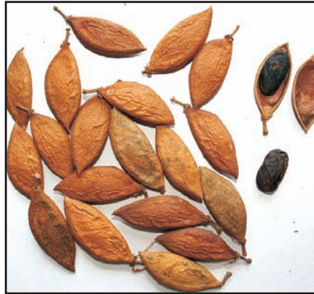
Dried Pongamia pinnata fruits and seeds.