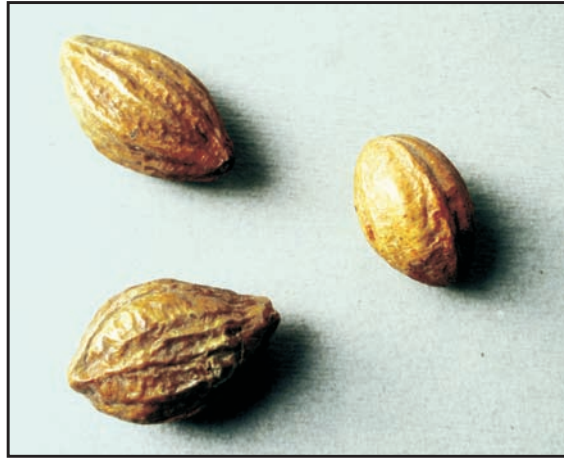
Dried fruits of Haritaki .