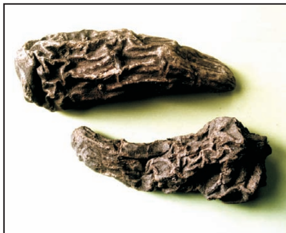
Dried Ativisha roots.