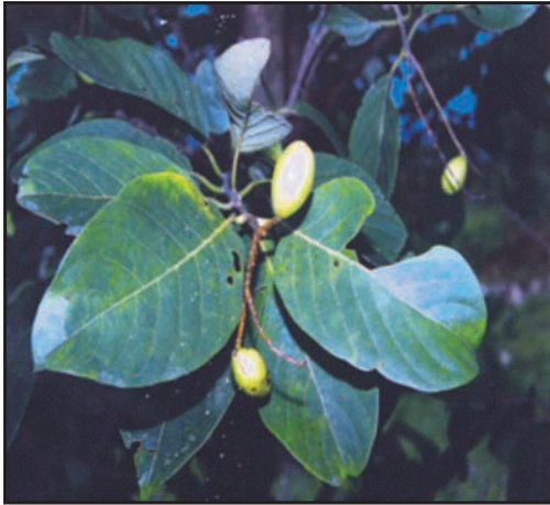
Haritaki fruits and leaves.