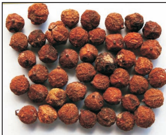
Dried fruits of Amalaki .