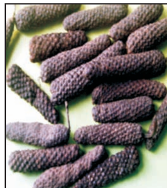
Dried fruits of Pippali .

Main chemical constituents of Shunthi 1 : Essential oil, pungent constituents (gingerol and shogaol), resinous matter and starch.